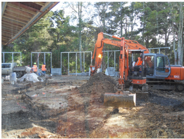
Current view from the dining room, looking out towards the elderly and general adult outdoor areas.

If you are interested in receiving Blueprint automatically by email, you can 'join the mailing list' by visiting the redevelopment website and filling in your details.