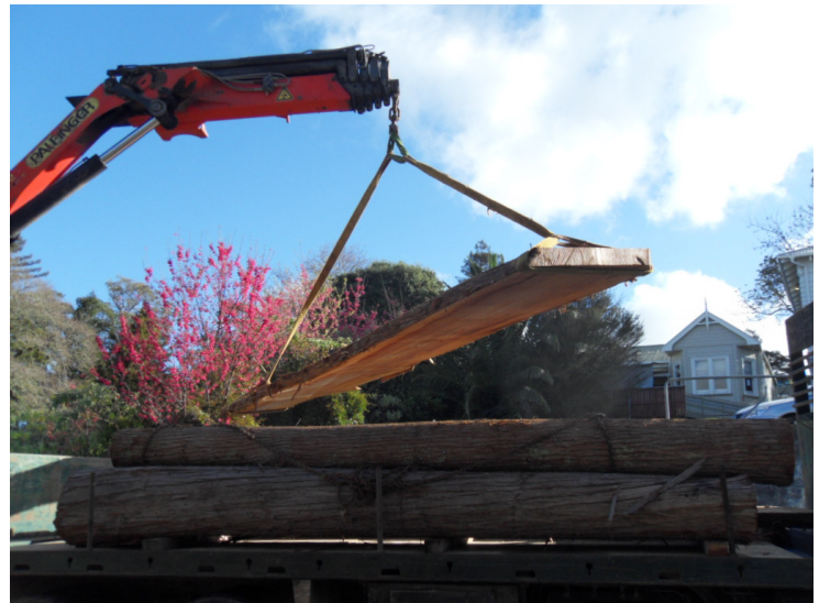
Timber for the pou and carvings has been milled and is transported to the carvers workshop.

We wait in anticipation to see the pou and the carvings when they are unveiled at the opening ceremony later this year.